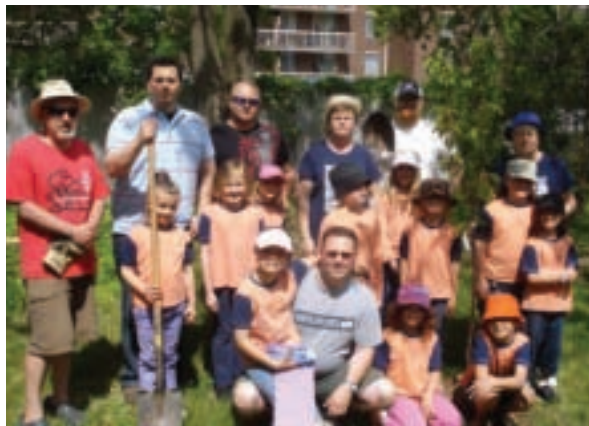
The 21st Hamilton Brownies volunteers.