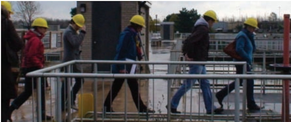
Green Venture held a partner stakeholder meeting for the RiverSides Stormwater Management program. In this photo you can see partners at Hamilton's Water Treatment Facilities on a tour to learn about the impacts of stormwater run-off.