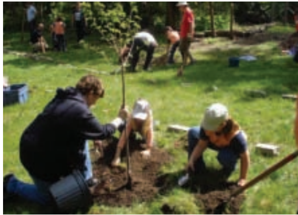
The 21st Hamilton Brownies volunteered their time to help plant cherry trees and raspberry bushes at EcoHouse. In 2009, 210 volunteers contributed over 820 hours to Green Venture programs and services!