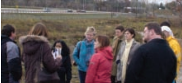
The Stormwater Management Stakeholder Group looked at ways to minimize impacts of stormwater in the community. This is the site of the Red Hill Valley Parkway flood in July 2009.